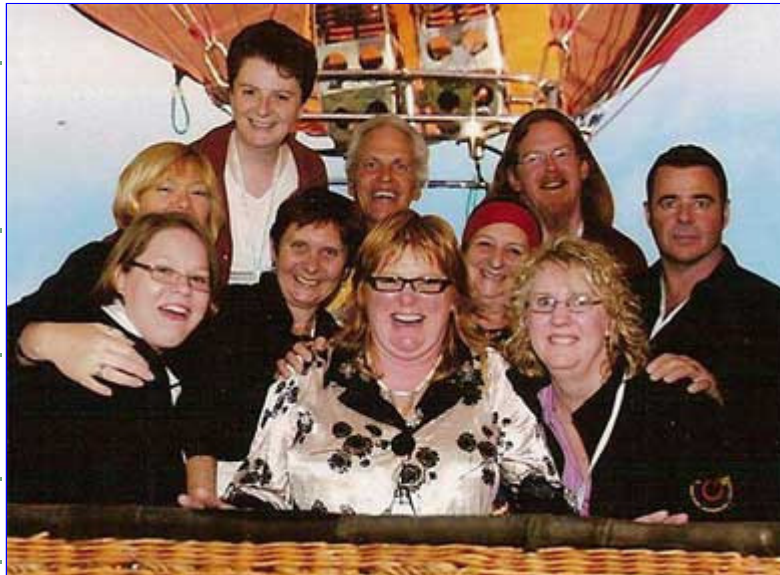
International Coalition takes flight